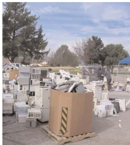
Electronic waste ready to be recycled.

All computers, printers, monitors and peripherals, TVs, VCRs, DVD players, fax machines, stereos, radios, cell