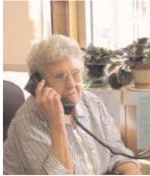
Assistance is just a phone call away.

Do you or does someone you know need special assistance in an emergency? The Ventura County Human Services Agency (HSA) maintains a registry of individuals who require special consideration during emergency situations. The City of Camarillo is assisting the HSA by collecting information from residents who require special help evacuating their homes.