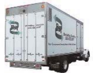
Avoid identity theft by taking preventive actions, such as shredding, to protect yourself.

For more information, please call RSI Services at (805) 236-5138.