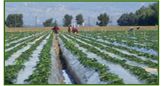
Berries require low salt water

The Calleguas Regional Salinity Management Project (SMP) is a regional pipeline that will collect salty water generated by groundwater desalting facilities and excess recycled water and convey that water for re-use elsewhere. Any unused salty water will be safely discharged to the ocean, where natural salt levels are much higher.