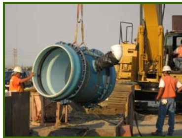
Installing 48" pipe

The SMP is vital to the region's water reliability as imported supplies from the State Water Project have become increasingly vulnerable to drought, catastrophic levee failures from flood and/or seismic events, and regulatory shut downs of pumping facilities to protect endangered species.