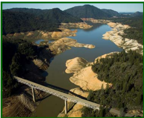
The State Water Project is becoming less reliable due to drought and regulatory restrictions.

The SMP will improve water supply reliability by allowing for the development of up to 40,000 acre-feet of new, local water supplies each year (one acre-foot is enough water for two households for one year) and expanding the distribution and use of recycled water from areas with abundant supplies to areas of need.